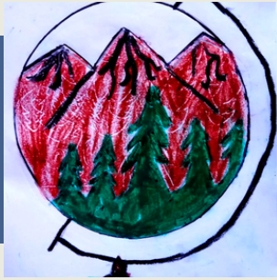
Ardra TP 06-10 years